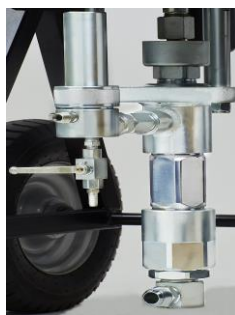
Inline fluid filter