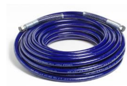
Paint hose (textile/ metal wire)